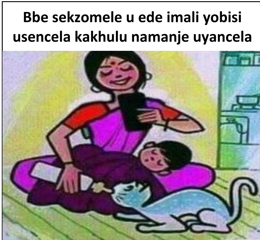
[Isithombe sicashunwe kwi-Inthanethi]