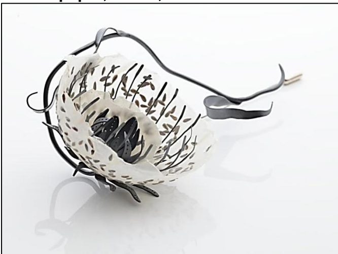
Image B: Sabrina Meyns, Brooch 2 handmade paper, seeds, silver and steel