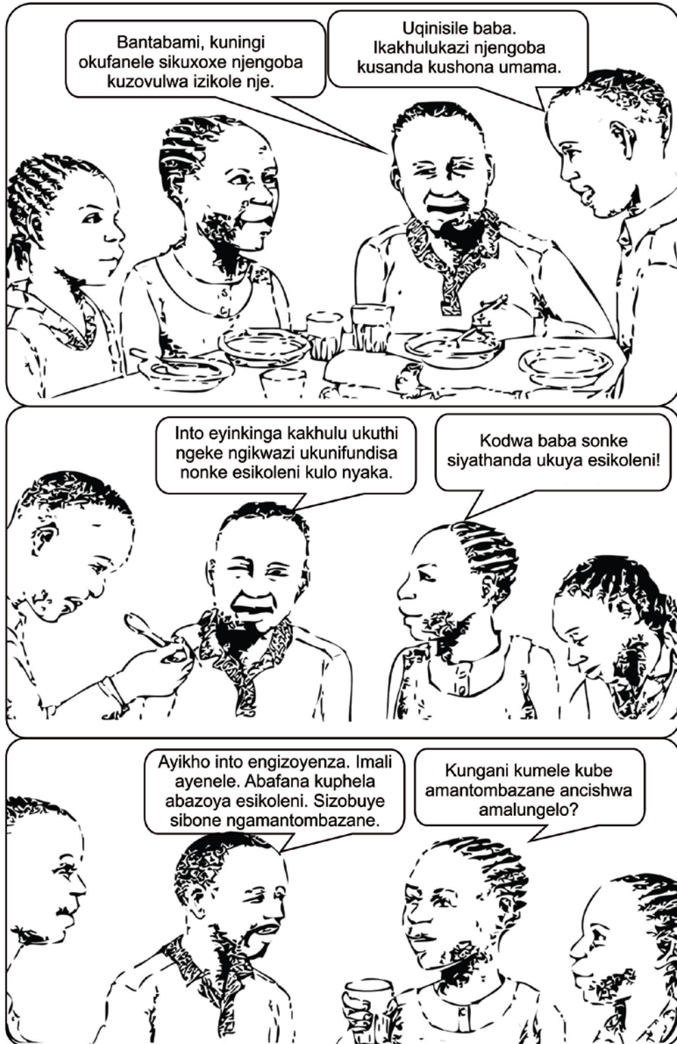
[Icashunwe encwadini Kuyasa , Ibanga 9 ikhasi 27]

4.3 Bhekisisa lesi sithombe bese uphendula imibuzo ezolandela.